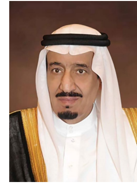
King Salman Bin Abdulaziz

We are not worried about the future of the Kingdom, but rather we look forward to a brighter future, which we can create - with God's help - with its human, natural, and acquired wealth that God has bestowed on it.