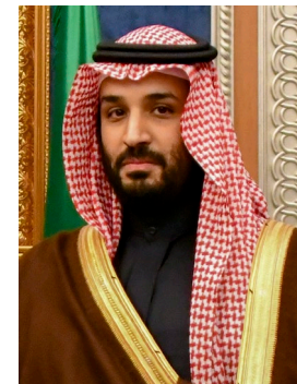
Prince Mohammed Bin Salman